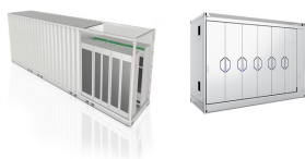
ABB offers a range of battery energy storage systems for solar applications, including residential applications such as its photovoltaic inverter that allows storing of unused energy produced during the day. In August 2017, ???