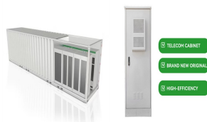
TELECOM CABINET BRAND NEW ORIGINAL HIGH EFFICIENCY

U.S. Solid USS-BSW06 Battery Spot Welder 14.5 KW 2500A Capacitor Energy Storage Pulse Welding Machine, Mini Portable Spot Welding Equipment for 18650, 21700 Lithium Battery Pack Building 12KW Capacitor Energy Storage Pulse Battery Spot Welder with 73B ???