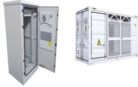
IMAGE OF ENERGY STORAGE DEVICE CONNECTION TERMINALS

What are energy storage systems? Energy storage systems are made up of different components that all contribute to the function of the overall system. Benefit from our portfolio of PCB connections, connectors, and electronics housings that demonstrate our strong innovation power.