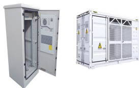
IMAGE OF ENERGY STORAGE DEVICE CONNECTION TERMINALS

What is a battery energy storage system (BESS)? Renewable energy sources such as photovoltaic (PV) and wind power are widely used; however, their intermittent nature impairs power supply quality by creating frequency distortions and irregularities in voltage. Battery energy storage systems (BESS) are utilized to flatten out and relieve fluctuation issues.