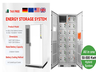
IMAGE OF LITHIUM IRON MOBILE ENERGY STORAGE BATTERY

The popularity of lithium-ion batteries in energy storage systems is due to their high energy density, efficiency, and long cycle life. The primary chemistries in energy storage systems are LFP or LiFePO4 (Lithium Iron Phosphate) and ???