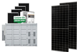
IMAGE OF LITHIUM IRON MOBILE ENERGY STORAGE BATTERY

A 100MW/200MWh project using semi-solid batteries has been connected to the grid in Zhejiang, China, reportedly the first project of its scale in the world. The Zhejiang Longquan lithium iron phosphate (LFP) energy ???