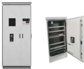
PHOTO OF HOUSEHOLD SOLAR LIGHT POWER STORAGE DEVICE

INVT Solar is a professional solar inverters manufacturer and national high-tech enterprise. Here we will talk about the practical design ideas and points to note in the household energy storage system (ESS). If a set of ???