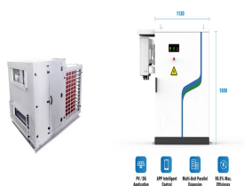
PHOTO OF HOUSEHOLD SOLAR LIGHT POWER STORAGE DEVICE

Solar accessories: This can vary, depending on the type of the solar power system. Popular ones are listed below. Solar charge controller: Once a solar battery is fully charged, based on the voltage it supports, there needs ???