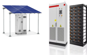
PHOTO OF HOUSEHOLD SOLAR LIGHT POWER STORAGE DEVICE

What is a household solar storage system? The core of the household solar storage system is photovoltaic +battery +energy storage inverter. Household energy storage and household photovoltaics are combined to form a household optical storage system. The optical storage system mainly includes cells,energy storage inverters (bidirectional converters),and component systems.