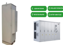
PHOTO OF HOUSEHOLD SOLAR LIGHT POWER STORAGE DEVICE

Most of us are familiar with certain kinds of electrical energy storage, or ESS. If you've ever used a household battery or driven an electric car, then you know that it's possible to store electrical energy in a form that can be ???