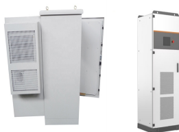
PHOTO OF HOUSEHOLD SOLAR LIGHT POWER STORAGE DEVICE

Solar PV cells that capture sunlight are placed in panels, which are in turn placed in arrays, to deliver solar power to homes and businesses. Australia is an ideal location for solar PV systems. One in 4 households now have solar ???