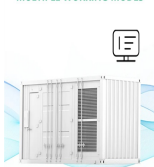
FLEXIBLE SETTING OF MULTIPLE WORKING MODES

It slowly but surely causes solar panel damage over time. Bird-proofing measures like netting or deterrent spikes are crucial. They can prevent from birds walking on solar panels, which scratches the material. Squirrels ???